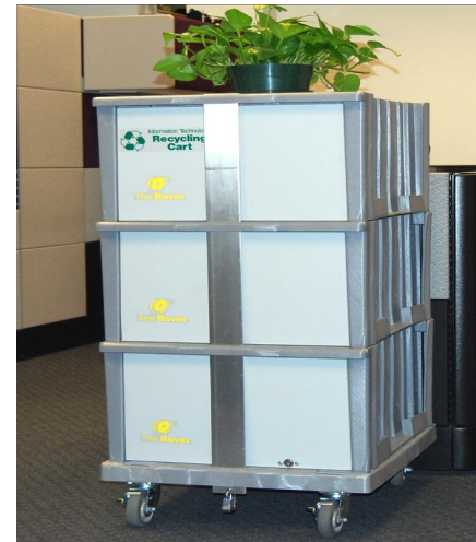
Safety and Security to Protect IT Hardware and Data 3"x9" Drop Slot with Entry Guard 24"x27"x49"

4D Mini-Rover Ideal for the internal churn of employee's Easy File Access Reduces Employee Downtime Security for Confidential Content