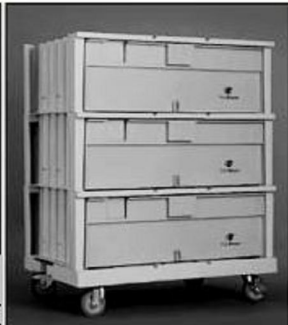
3D Moves the contents of a 4-drawer lateral file 42" x 27" x 53" 105"-135" of filing / 17 cubic feet