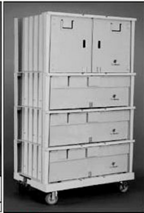
3DC Moves 1 employee's files, equipment & belongings 42" x 27" x 76" 105"-135" of filing / 28 cubic feet