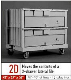
2D Moves the contents of a 3-drawer lateral file 42" x 27" x 38" 70"-90" of filing / 12 cubic feet