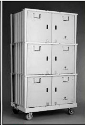
3C Moves up to 6 computers, cables & stock room supplies 42" x 27" x 78" 32 cubic feet